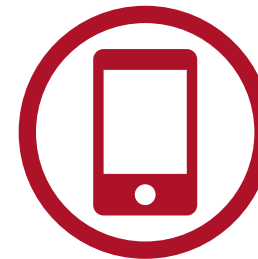
EMAILS AND TEXTS